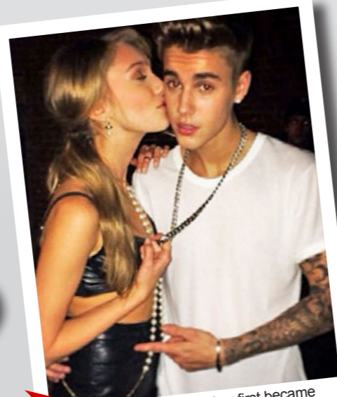
When Justin Bieber first became famous he was an innocent Christian boy, now he is infamous for his rebellion