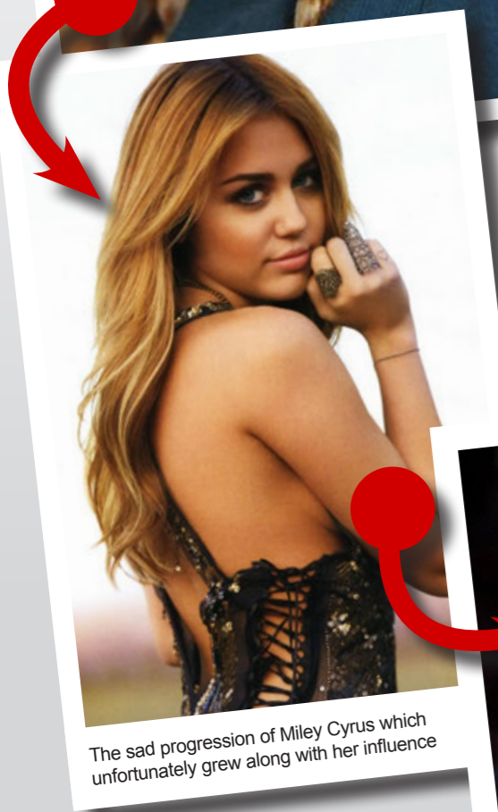
The sad progression of Miley Cyrus which unfortunately grew along with her influence